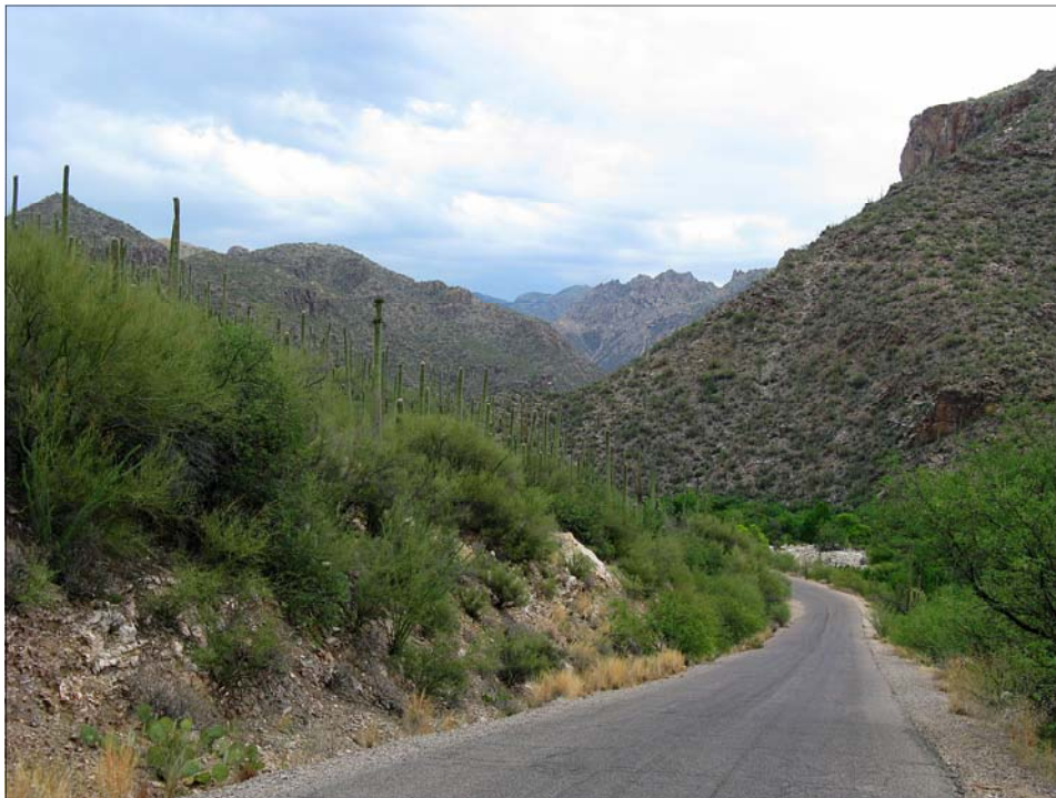
The entrance to spectacular Sabino Canyon, long a refuge for Tucsonans, opens up along this tram road from the Visitor Center.

The Sabino Canyon Recreation Area will continue to be very popular for picnicking, hiking, and appreciating the natural environment, becoming one of the biggest tourist attractions in the state of Arizona at 1.5 million visitors per year by 2009.